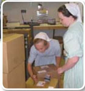
Volunteers Help Prepare Loaves & Fishes for Mailing