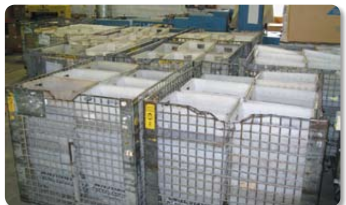
Below: Some of the Single Subscriptions Tubs Ready for the Mail Truck