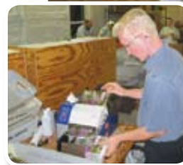
Volunteers Help Prepare Loaves & Fishes for Mailing