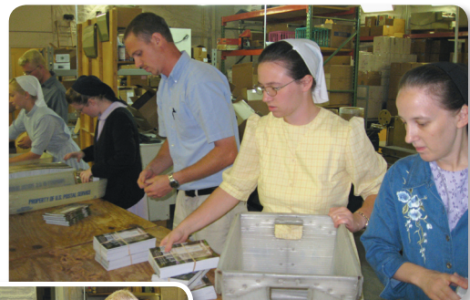
Volunteers Help Prepare Loaves & Fishes for Mailing