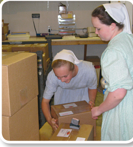
Volunteers Help Prepare Loaves & Fishes for Mailing