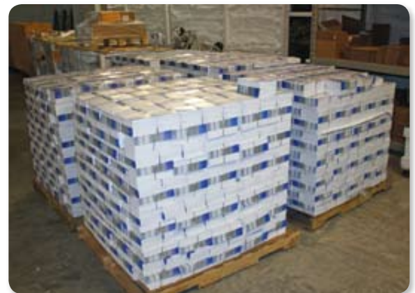
6 Tons of Loaves & Fishes Booklets