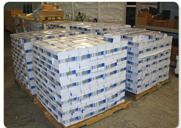
6 Tons of Loaves & Fishes Booklets