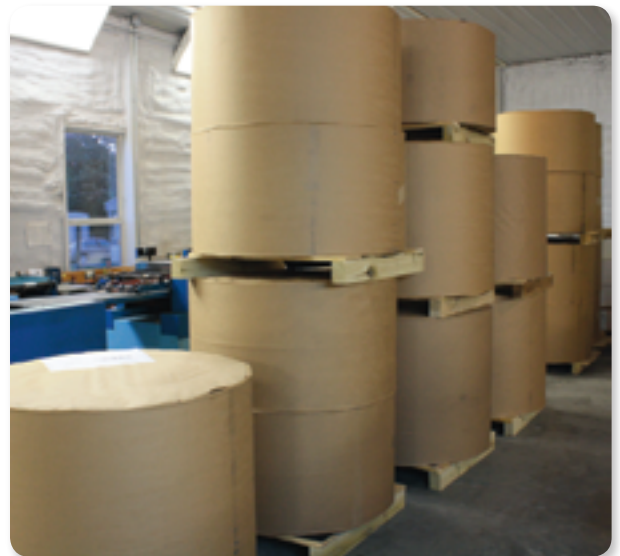
Paper for the Next Issue

Join the team of monthly sponsors and help us publish Loaves & Fishes four times per year!