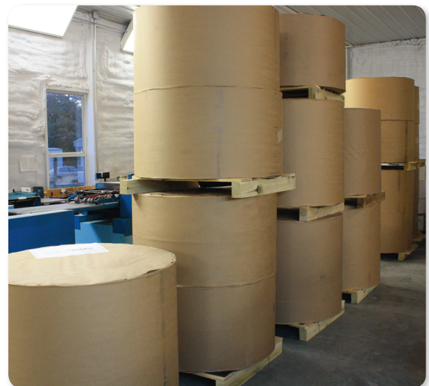
Paper for the Next Issue

Join the team of monthly sponsors and help us publish Loaves & Fishes four times per year!