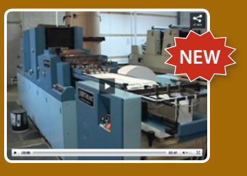
Lighthouse Shop Tour Video www.lighthousepublishing.org

Imagine 80,000 copies of Loaves & Fishes quietly influencing thousands of open hearts in prisons and jails across the USA.