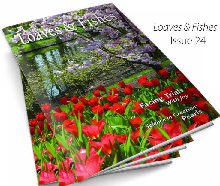
Loaves & Fishes Issue 24

The previous issue was mailed in January, and we hope to get this next one out in April. Please pray for the funds we need for Issue 24.