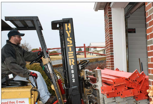
Setting up Warehouse Racks