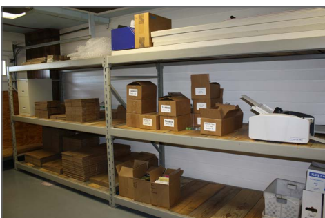
Racks in Packing Room